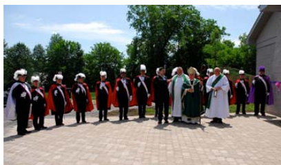
Knights of Columbus during Archbishop Prendergast's visit

If you want more information or you wish to join this great organization of Catholic men, just speak to any one of the gentlemen at church wearing a KofC nametag or visit http://olvis.ca/knights_of_columbus.html .