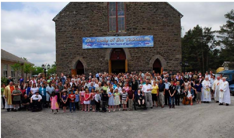
166 th Anniversary Celebration

http://www.olvis.ca/parish_council.html for a complete list of council members and feel free to share your ideas with them and maybe become active member of our beautiful Church.